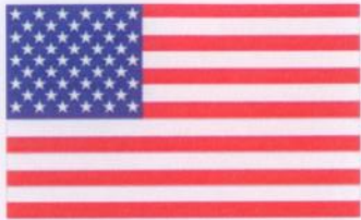
The National Institute of Standards and Technology of the United States of America