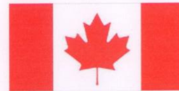
The Communications Security Establishment of the Government of Canada